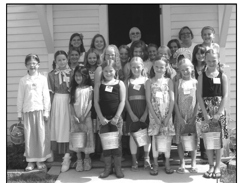
School House Days August 15th