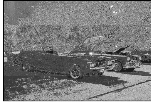
Canadian Cars At History Rocks