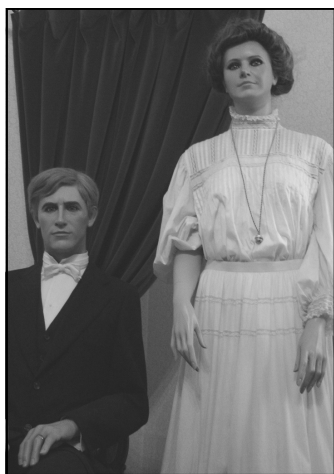
Mannequins in the Quiet Room

A customized computer desk is being built, to resemble the antique furnishings in the room. It will include a built-in computer and monitor that will have family photographs and historical information installed. Visitors may select which albums they want to view on a simple key pad. This is an excellent way to allow museum patrons to control which images they wish to view.