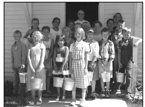
School House Days August 8th